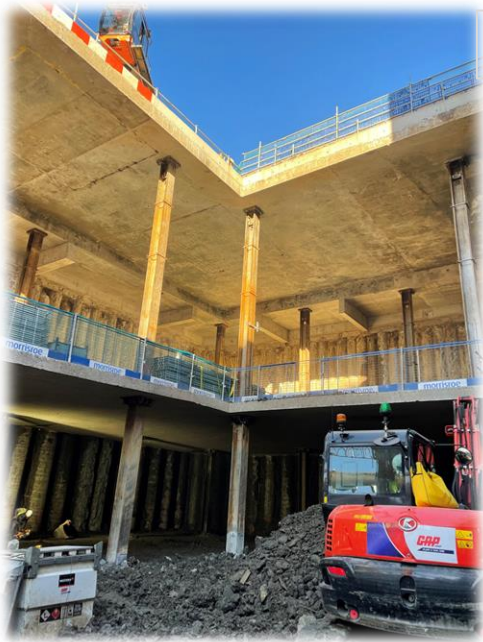
Completion of Basement excavation