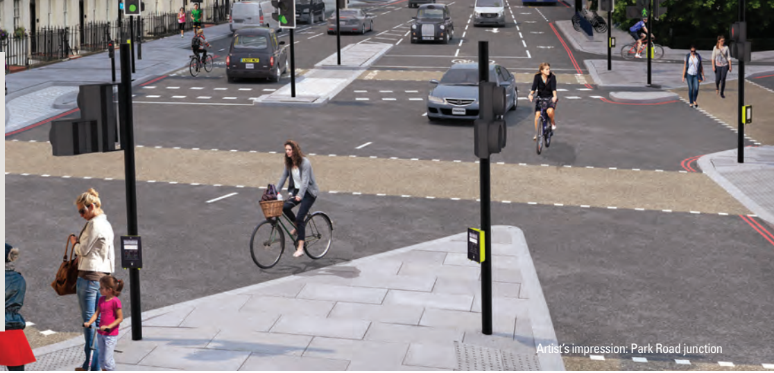
Artist's impression: Park Road junction