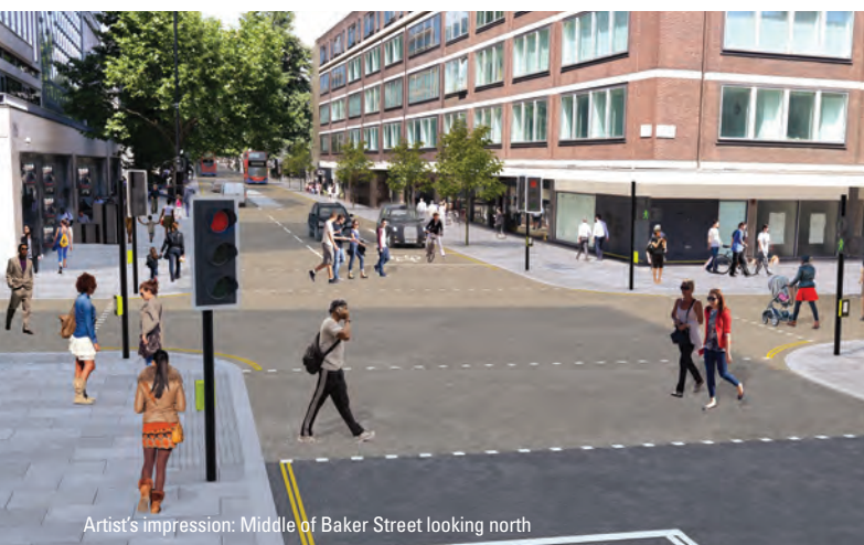
Artist's impression: Middle of Baker Street looking north

All works are scheduled to be finished by June 2019.