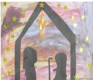
Art work: LR – Y2