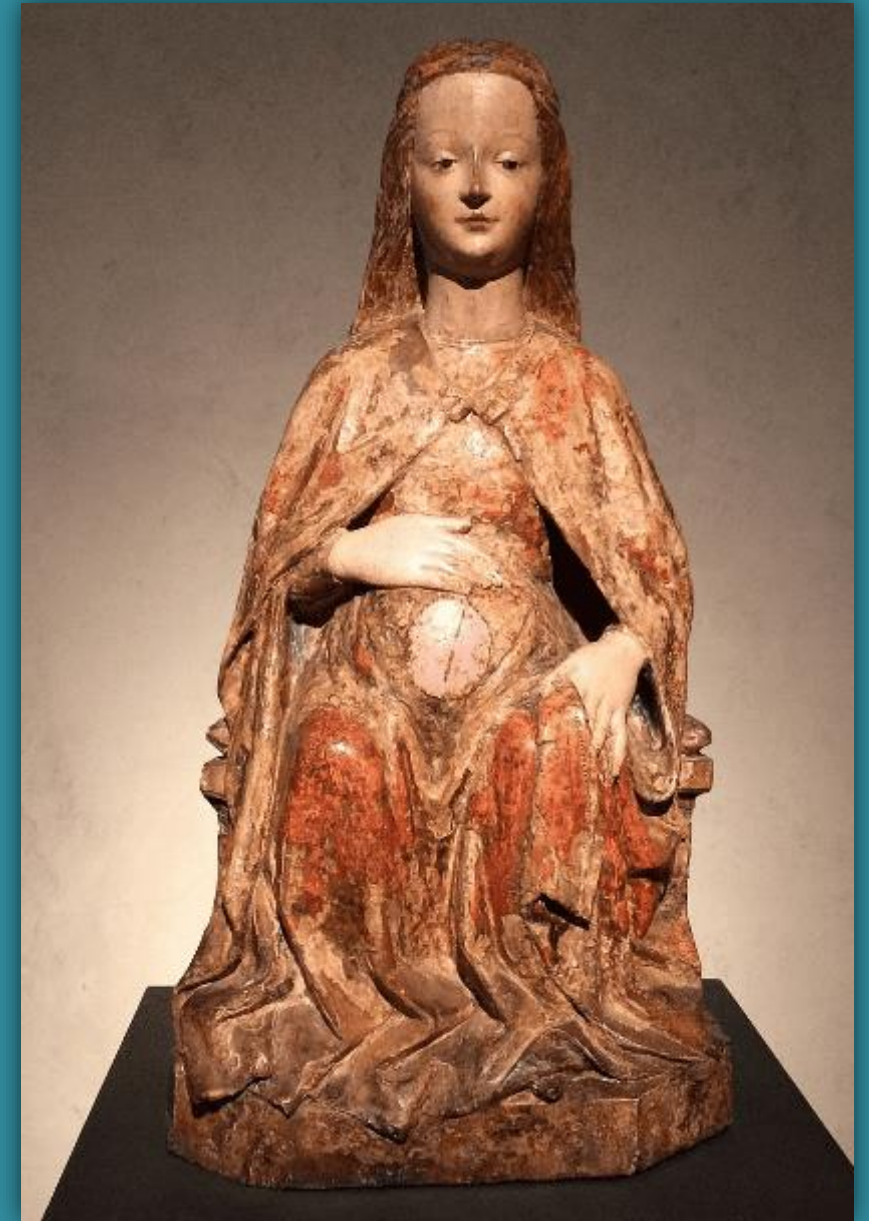
Maria Gravidia, International Gothic

Help us to be like Elizabeth and encourage others as they do the work entrusted to them by God.