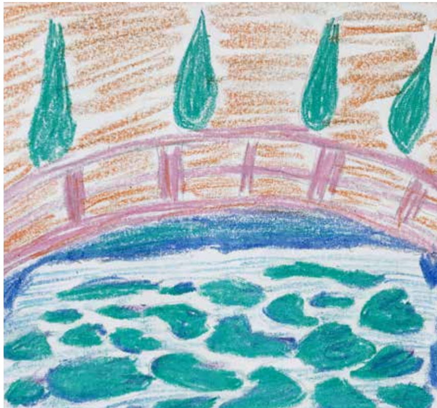
Artwork by pupil from Hampden Gurney C of E Primary School

For further advice you can speak to the Admissions Team or the school (if a church school), who will be able to offer you guidance on the likelihood of your child being offered a place based on the information you provide. It is not possible to give any guarantee of the outcome of your application.