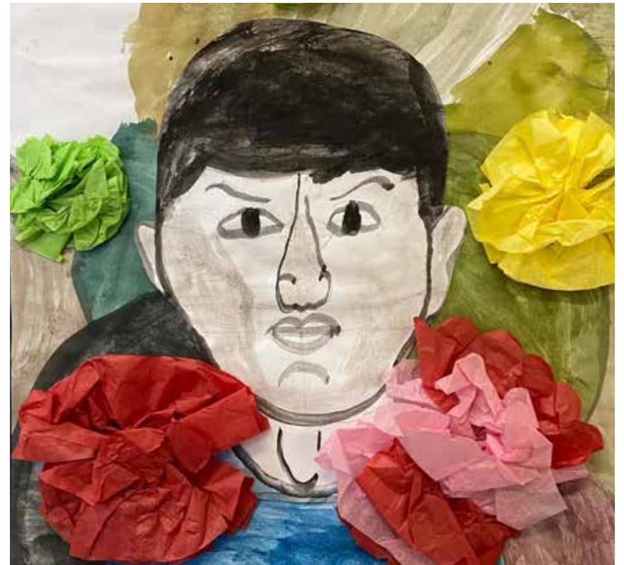
Artwork by pupil from St. Barnabas' C of E Primary School

However, you need to be aware that by law, infant classes should not exceed 30, so there are very limited grounds that an appeal can be upheld. Further information will be included in the primary schools Admissions Brochure.