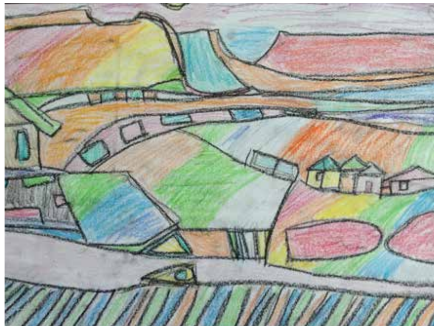
Artwork by pupil from Essendine Primary School

reason, your application will be considered after all of those which were submitted on time. This will greatly affect your chances of being offered the school you want.