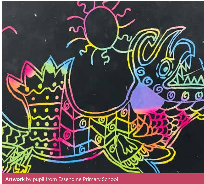
Artwork by pupil from Essendine Primary School